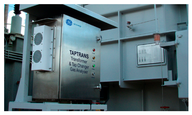
*Note - exact feature will depend on Perception version purchased