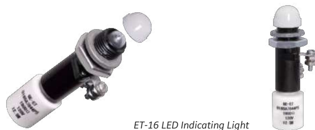
ET-16 LED Indicating Light

The ET-16 specifies long - life LED's and simple "pushtwist" type plug design for both the lamp and the resistor. This is accomplished by incorporating a bayonet base on both components.