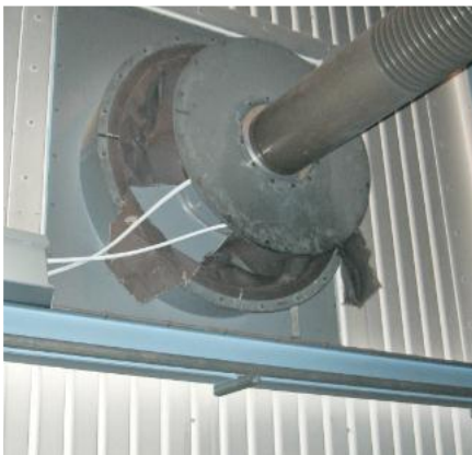
DC valve hall wall bushing