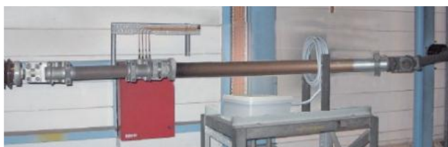
0.1% class Closed Loop F3 metering CT for DC valve hall

The sensing fiber resides in the PVC conduit which attaches directly to the sensor box. Standard telecommunications optical fiber cabling and wire cabling connect the electronics module to the sensor box. Because the sensor box has a wire connection to the electronics, the sensor box should not be installed in a high-voltage environment. However, it may be installed in a low-voltage environment allowing the sensing cable to be wrapped around a high-voltage bushing.