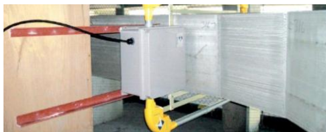
Dynamp 225 kA 0.1% class DC CT for aluminum smelting