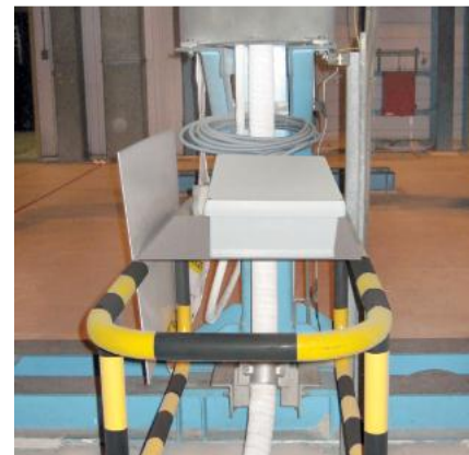
Undersea cable metering & protection

The type A F3 CT has metering grade accuracy to 0.15%, and it can measure both AC and DC currents with this accuracy from 1 A to 160 kA, depending on the number of sensing cable wraps used to measure the current.