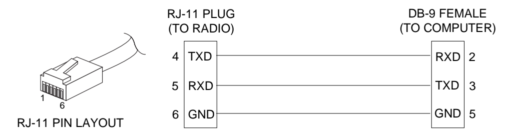
Figure 1. RJ-11 to DB-9 Adapter Cable (for PC Diagnostics & Control)

To connect a PC to the radio's DIAGNOSTICS port, an RJ-11 to DB-9 adapter cable (MDS P/N 03-3246A01) is required. If desired, this cable may be constructed using the information shown in Figure 1.