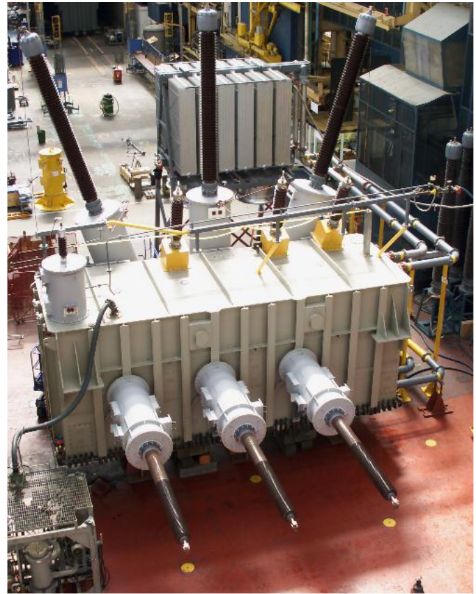
203 MVA, 415/111.5 kV HVDC Converter Transformer in Test

GE designed, constructed and supplied all the equipment for the two new converter stations. The two AC systems are interconnected by two HVDC converter stations including two 203 MVA, 415/111.5 kV HVDC converter transformers on both the Swedish and Danish sites: one star-star connected and the other star-delta connected.