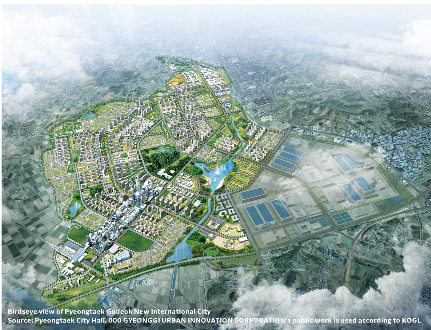
Birdseye view of Pyeongtaek Godeok New International City

GE's HVDC technology to power a new industrial city in South Korea