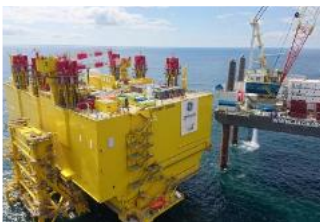
AC/DC Offshore Converter Station