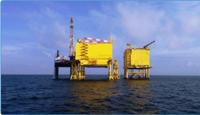
The central yellow structure is the DolWin3 Converter Platform

GE has also been awarded a five-year service contract covering the complete offshore converter platform, as well as the onshore converter system. This includes inspection, preventive and corrective maintenance, refurbishment and repair, spare parts management and a technology support line.