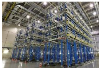
Valve Hall on the Offshore Station