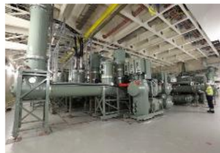
GIS Installed on the AC Substation