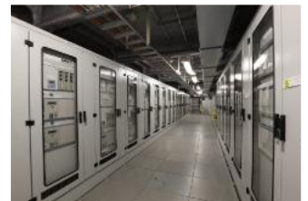
Control Room on the Offshore Station