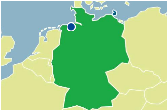
83 km Undersea HVDC Line to the Coast