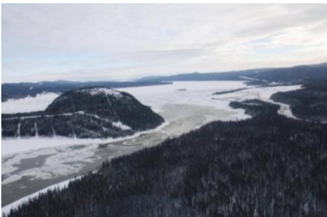
Lower Churchill River, Labrador, North East of Canada