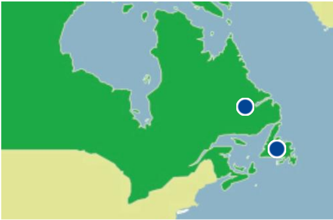
The HVDC Link From Muskrat Falls to Soldiers Pond