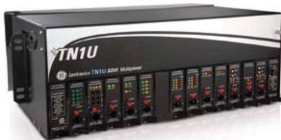
TN1U SDH Multiplexer