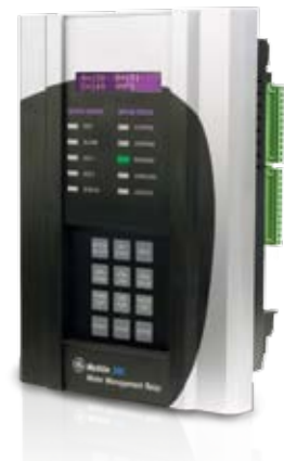
369 Motor Management Relay