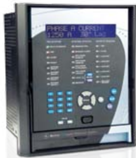
750 Feeder Protection System