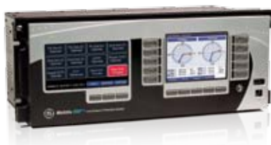
D90 Plus Line Distance Protection System