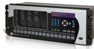
N60 Network Protection System