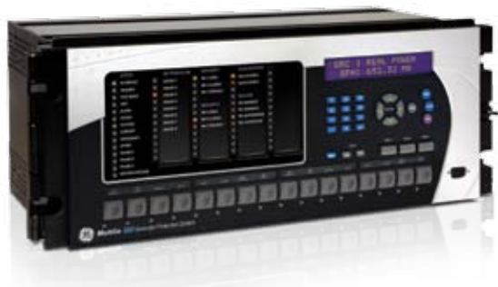
G60 Generator Protection System