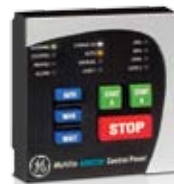
MM200 Control Panel