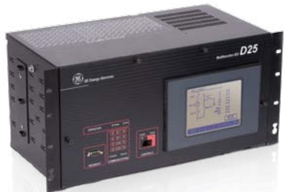
D25 Multifunction IED