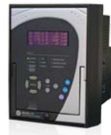
350 Feeder Protection System