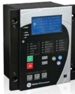
F650 Bay Controller